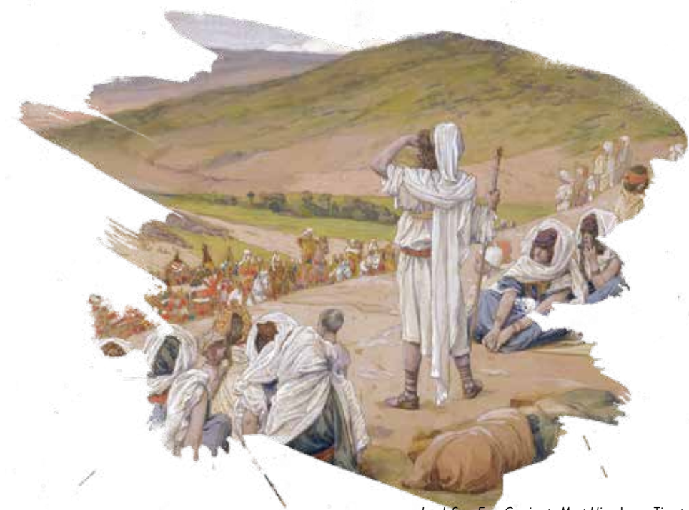
Jacob Sees Esau Coming to Meet Him, James Tissot