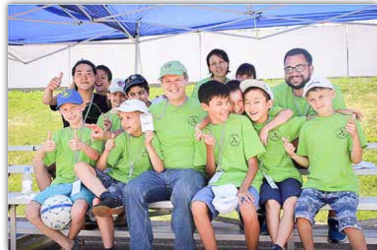
Central Asia Short Term Mission Trip, sports camp for orphans