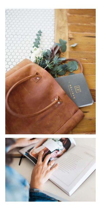
\begin{array}{c} \mathsf{I} \quad \mathsf{B} \in \mathsf{L} \mid \mathsf{E} \lor \mathsf{E} \\ A \ Study \ of \ the \ Nicene \ Creed \end{array}

Christians all over the world have used the Nicene Creed for generations and centuries to put into words what it is that we believe about who God is. Do you know what you believe and why you believe it? Have you ever wondered how to better articulate things that you've experienced about God? For nine weeks, explore the language of the Nicene Creed. Paired with scripture, we will have a better understanding of the history of our faith and of our God.