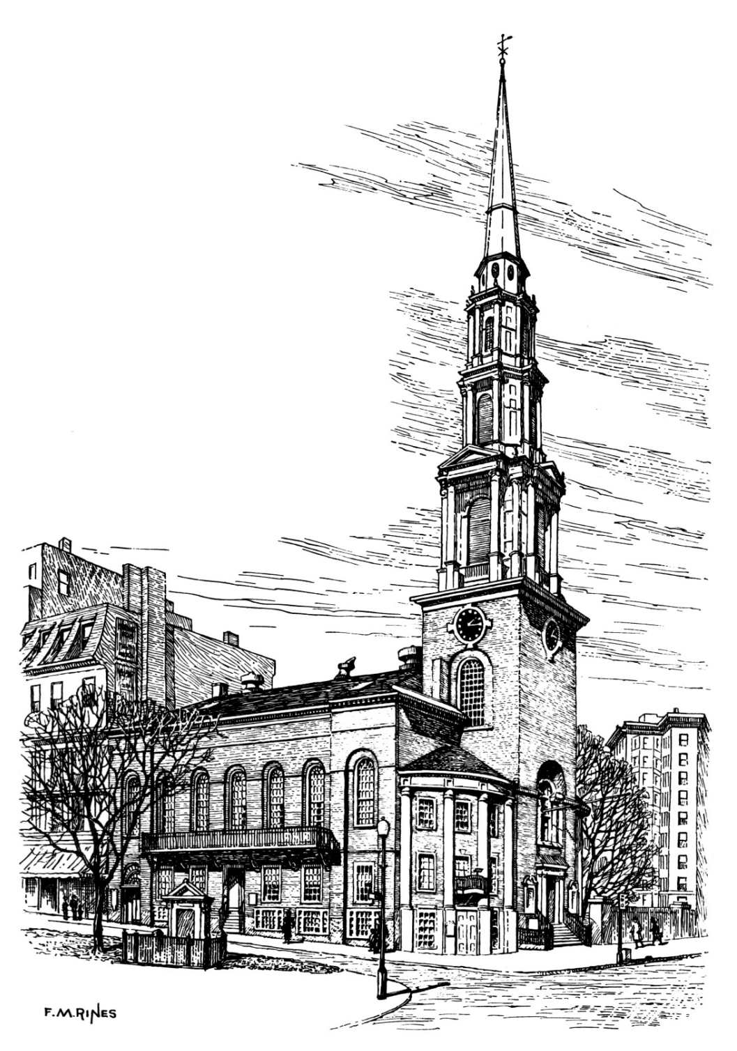
Service of Worship Park Street Church | The Lord's Day, October 17, 2021