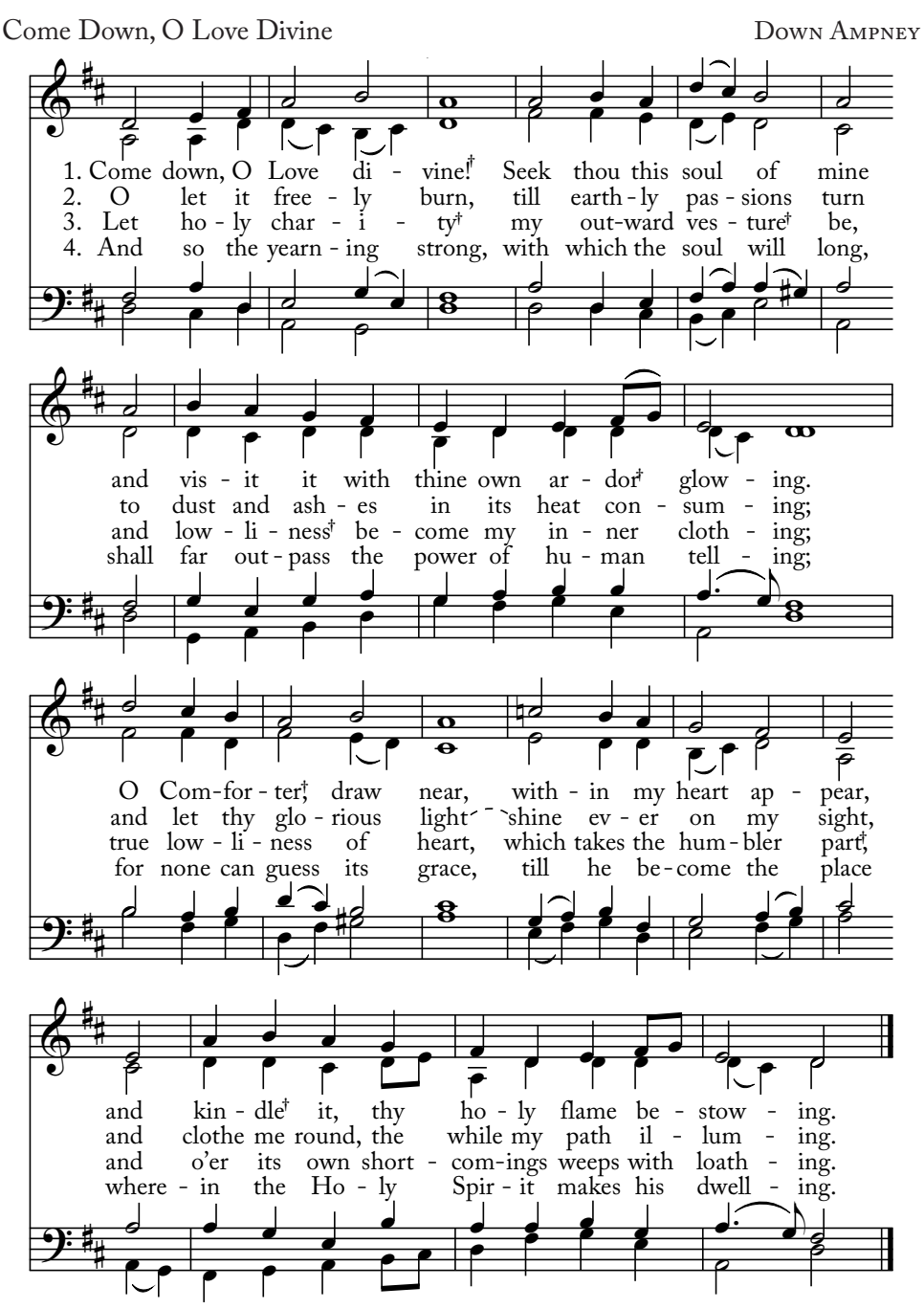
† Love divine: The Holy Spirit; cf. Rom. 5:5 | Comforter: The Holy Spirit; cf. Jn 14:16 KJV | ardor: passion, from Latin to burn | kindle: stir up; cause to burn | charity: love, especially Christian brotherly love | vesture: clothing | lowliness: humility | humbler part: role of a servant