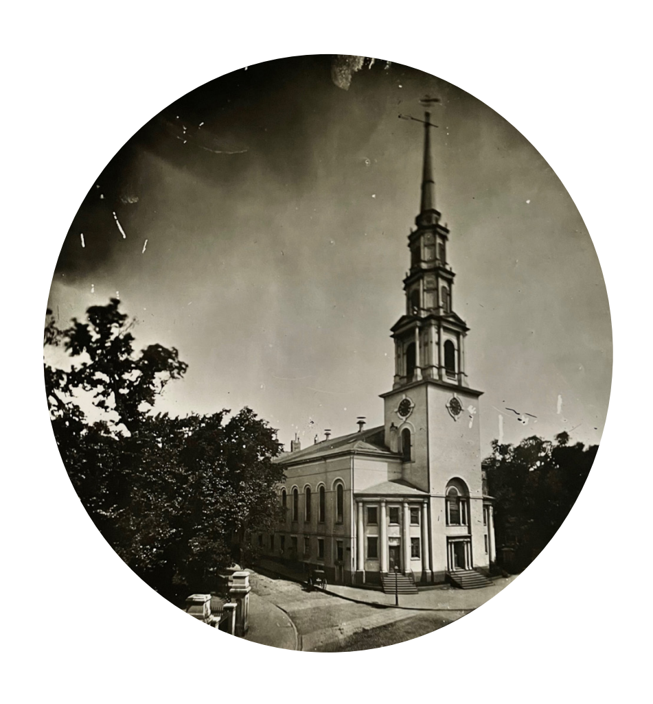
Service of Worship Park Street Church | The Lord's Day, July 24, 2022