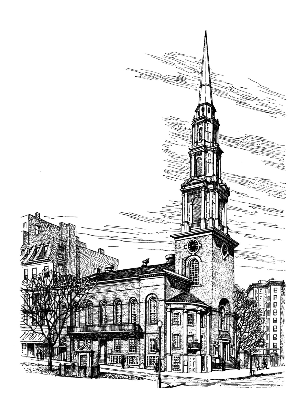
Service of Worship Park Street Church | The Lord's Day, June 11, 2023