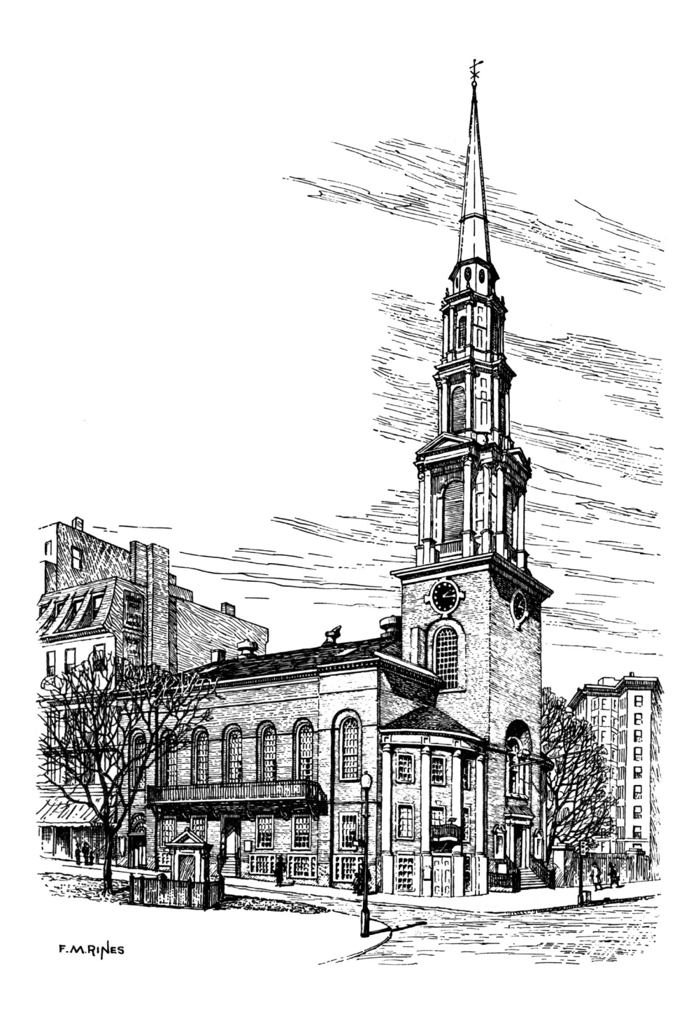
Service of Worship Park Street Church | The Lord's Day, August 13, 2023