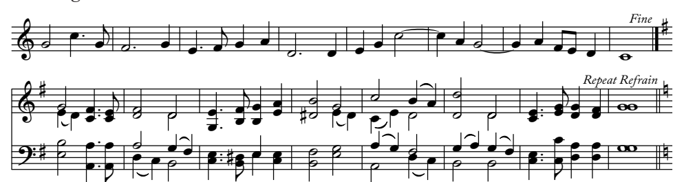
Lift high the cross, the love of Christ proclaim, till all the world adore his sacred Name.