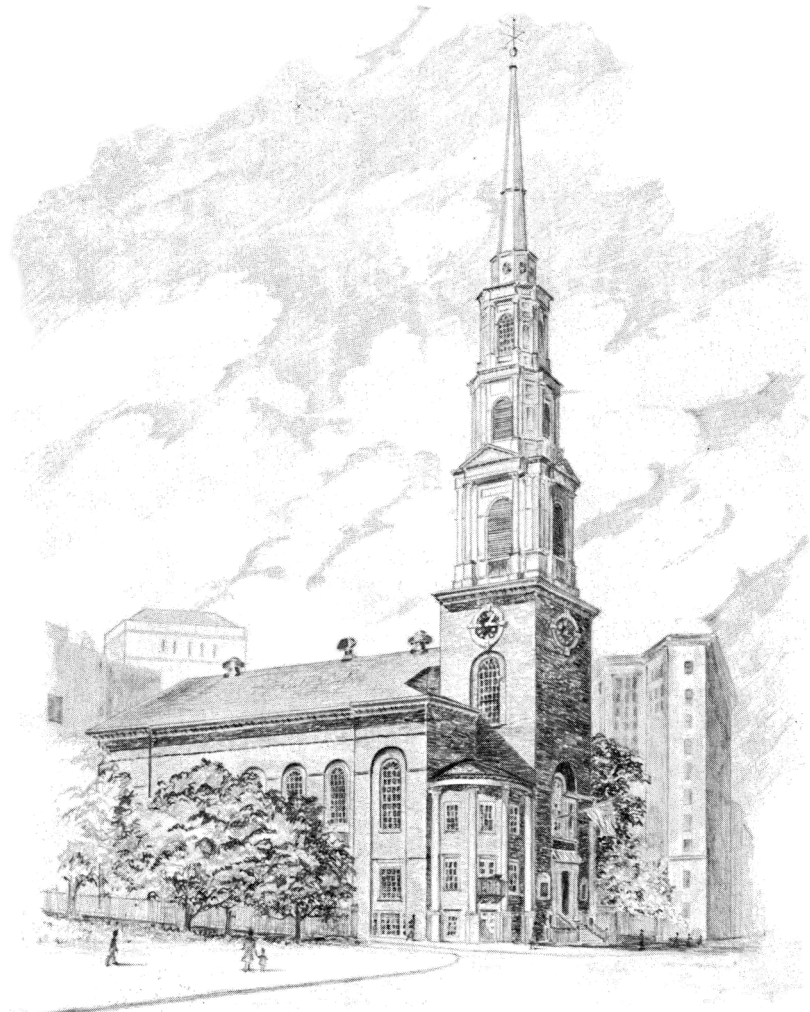
Park Street Church, Boston, Mass.